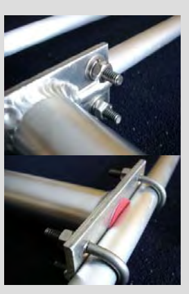
Heavy-duty dipole fixture