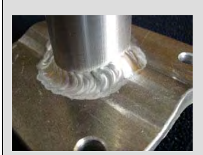
Expert TIG welding