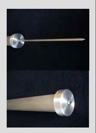
Optional lightning rod

*Site-specific mounting hardware is necessary with theses antennas. Please consult JAG to determine suitable clamps for your application.