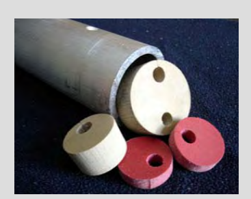
Natural rubber plugs